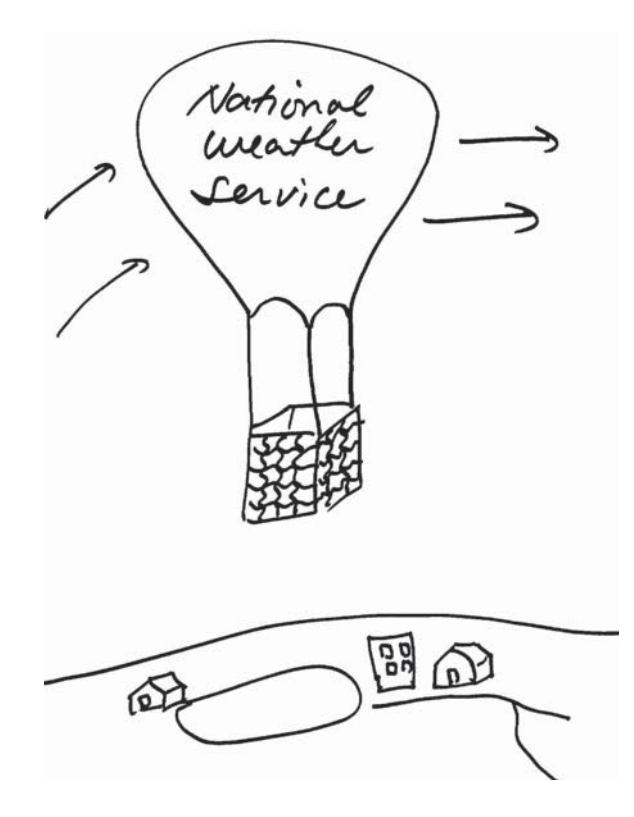
Figure 1.47: Weather balloons float along at the average velocity of the fluid and measure velocity, temperature, and other variables of interest to weather forcasters. This is an example of a measurement of properties along a pathline.