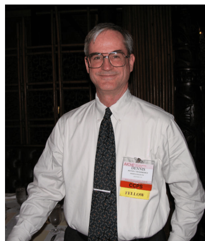
Dennis Hendershot, photographer for these pictures, has this picture taken by Erdem Ural